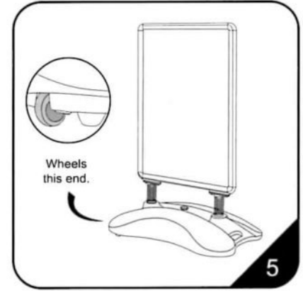
Place the poster in & then the clear plastic poster cover before closing the poster frame sides. Repeat for the second side. The sign is now ready to be moved.