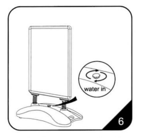
Please fill with water, or use sand in the base.

NOTE: When moving the stand while the tank is full, carefully lift the side of the base with the Carrying Handle and tilt the stand up so it rolls on the wheels located on the opposite side of the handle. Do not attempt to roll the stand over steps or curbs. Always place the stand on a flat, even surface.