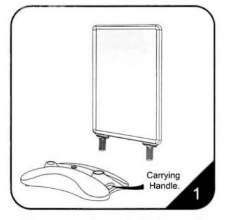
The carton contains a water-filled base and a poster frame.

Note: to avoid any accidental loss of components, please do not dispose of packaging until the sign is fully assembled.