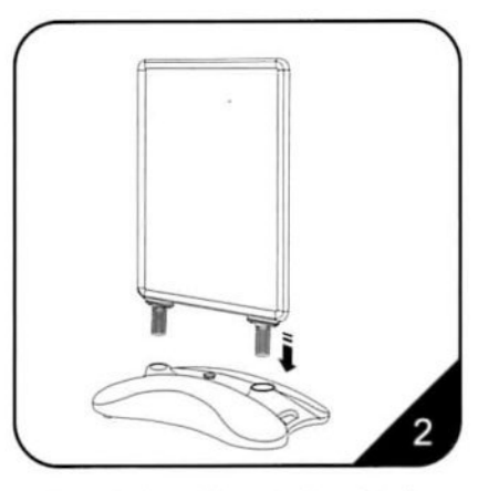
Insert the legs of the poster frame into the holes of the water-filled base.