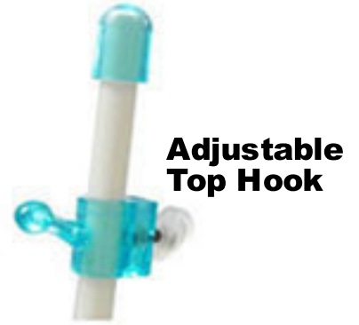
Adjustable Top Hook

18" to 40" wide 59" to 72" tall Grommets in the corners