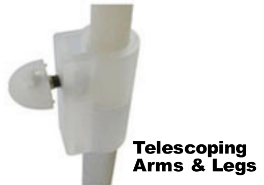
Telescoping Arms & Legs